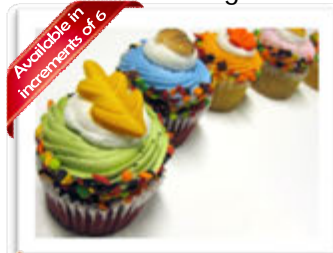
Rg, Cup Cake Fall EDIBLE Decor