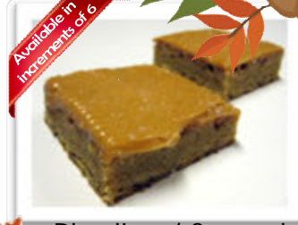
Blondie w/ Caramel 3x3