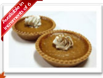
Rg. Sweet Potato Tart