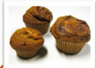
Pumpkin and Cream Cheese Muffin Rg