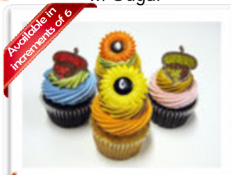
Rg, Cup Cake Fall PLASTIC Decor