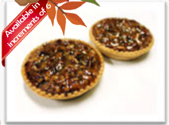
Pecan Tart Rg