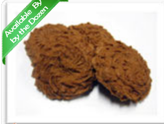
Maple Tea Cookie