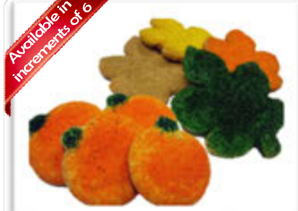
Fall Cookie Assortment w/Sugar