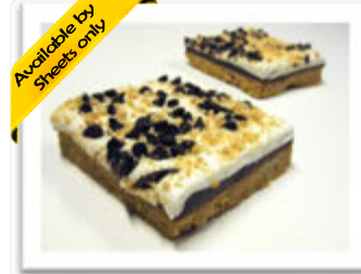
S'more Bars 3x3