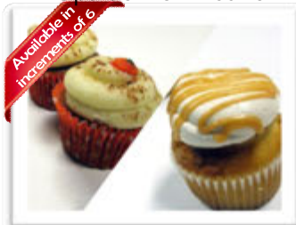
Rg Pumpkin Spice Cupcake Rg, Salted Caramel Cupcake