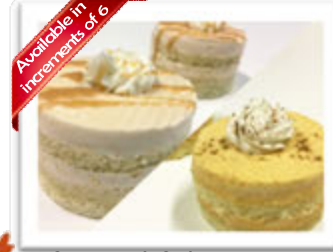
Caramel Cake Pumpkin Spice Cake