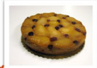
10'' Pear & Cranberry Upside Down Cake