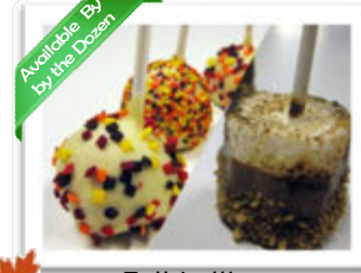
Fall Lollipop S'mores Pop