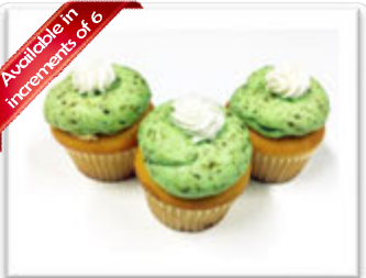
Rg, Pistachio Cupcake