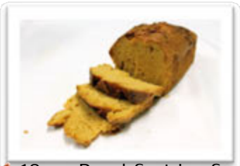
18 oz. Breakfast Loaf, Apple SPI CE