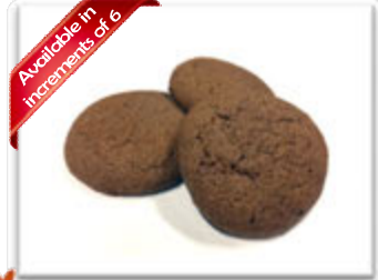
Pumpkin Spice Cookie