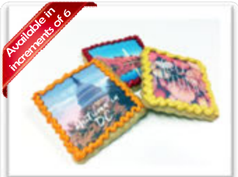
Fall Jubilee Cookies