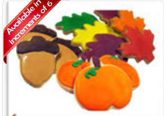
Fall Cookie Assort. w/I cing